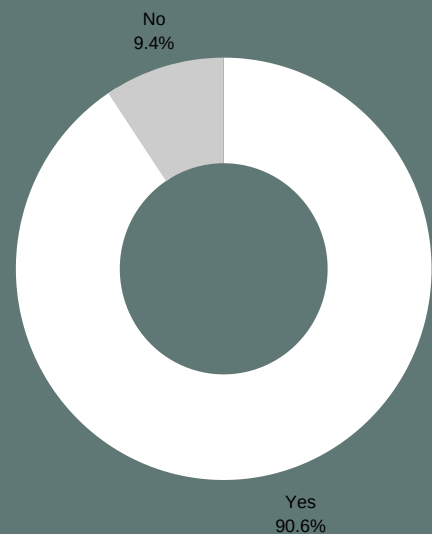
Figure 4: Would you start using a reusable water bottle after the installation of fountains?